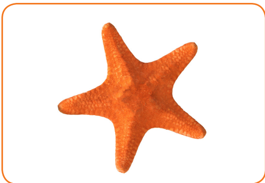
Class: Asteroidea Example: Sea Star