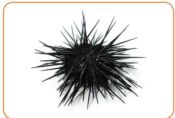
Class: Echinoidea Example: Sea Urchin

Sea Stars and Sea Urchins appear very different but are related and are in the same phylum. What do they have in common?